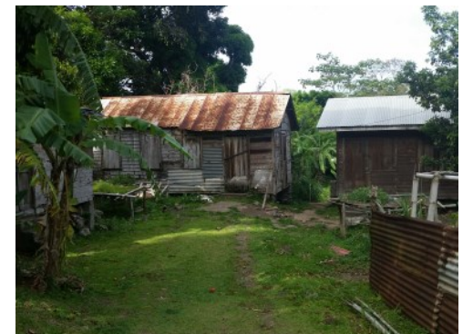
Remains of the Cocoa Facility at Montreuil