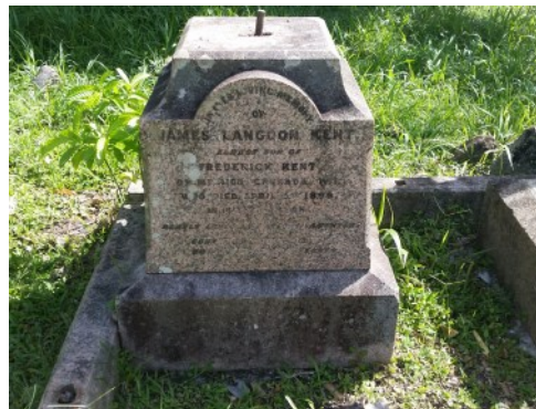
Kent Family Cemetery

Mt. Rich is an old sugar and cocoa estate with ruins going back to the French period (pre-1763). The current "Plantation House" was built by the Kent Family around 1880. They lived there until the 1960s. The building was later leant to the Anglican Church but was eventually abandoned. Contrary popular belief, it was not damaged during Hurricane Ivan.