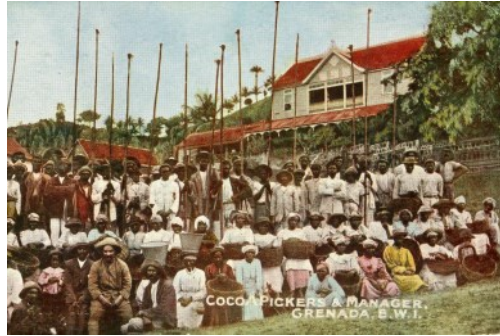
Workers on the Kent's Estate, ca. 1910

The “ Punch Bowl ” is a small volcanic crater just 100m wide, believed to have been part of the last volcanic explosions, within the past 10,000 years.