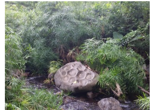
Workstone at the Montreuil Site

Montreuil was once a sugar and cocoa estate, with ruins dating to the French period. A large Amerindian village was also here, with artifacts dating from AD 750 through European contact. The Montreuil site is one of just a few inland villages known (most of the other 90 sites are on the coast)! The occupants of this site were likely responsible for the rock art at Mt. Rich.